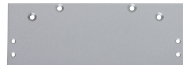
DCL2000 Parallel arm