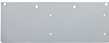
DCH1000 Parallel arm